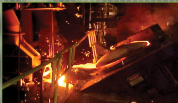
Reliable, consistent and cost effective refractory performance in the coreless furnace requires a "systems approach" that involves the refractory components and installation process.

The original TOP CAP material required patching every 10-20 hts, and it did not meet customer demands. As an upgrade, UNI-RAM VR-793A TOP CAP was installed because its mechanical strength and volume stability are much more compatible with the UNI-RAM VR-790A, thereby running 50-70 hts before patching. To increase TOP CAP reliability even more, UNI-RAM VR-797A TOP CAP will be installed, as its composition will be most compatible with UNI-RAM VR-790A, showing more resistance to mechanical abuse along with permanent linear change (PLC) characteristics that closely mirror UNI-RAM VR-790A.