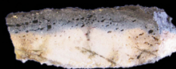
Hotface surface lining furnace #6-185 heats