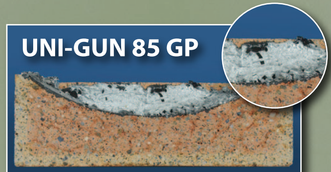
UNI-GUN 85 GP

Penetration: ..... None Adherence: ..... Moderate Silicon Pickup: ..... 0.05% Iron Pickup: ..... 0.03%