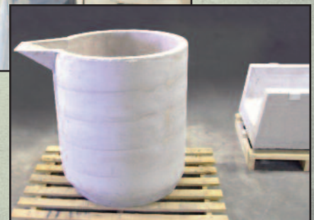
UNI-CAST FS-6A is used for many precast aluminum handling applications, including ladle inserts and troughs.